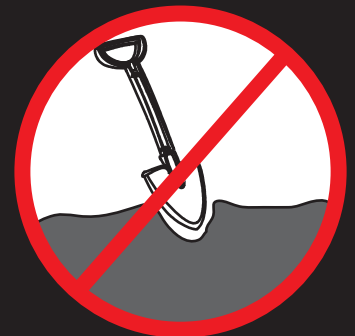
Dirt & Stones

Please prepare your yard waste properly.